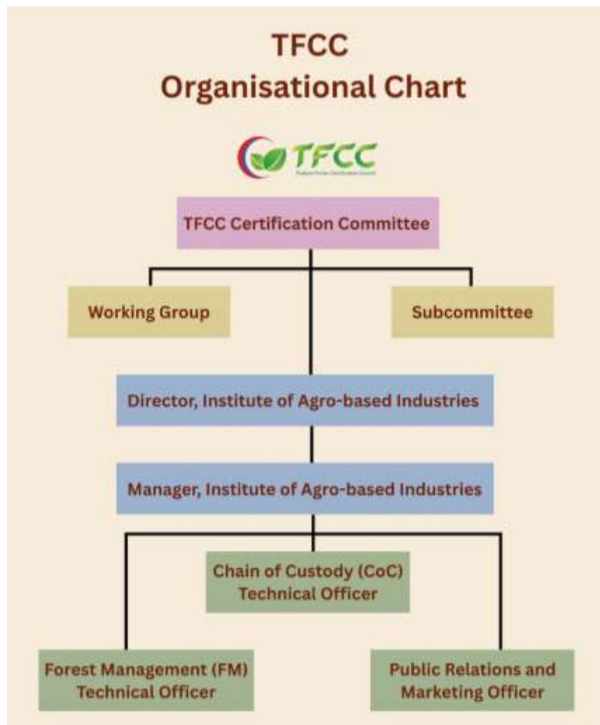
Figure 1: TFCC Organisational Chart

6.1.1 In Thailand, The Federation of Thai Industries (FTI.) acts as PEFC authorised body on behalf of the PEFC Council's as National Governing Body (NGB).